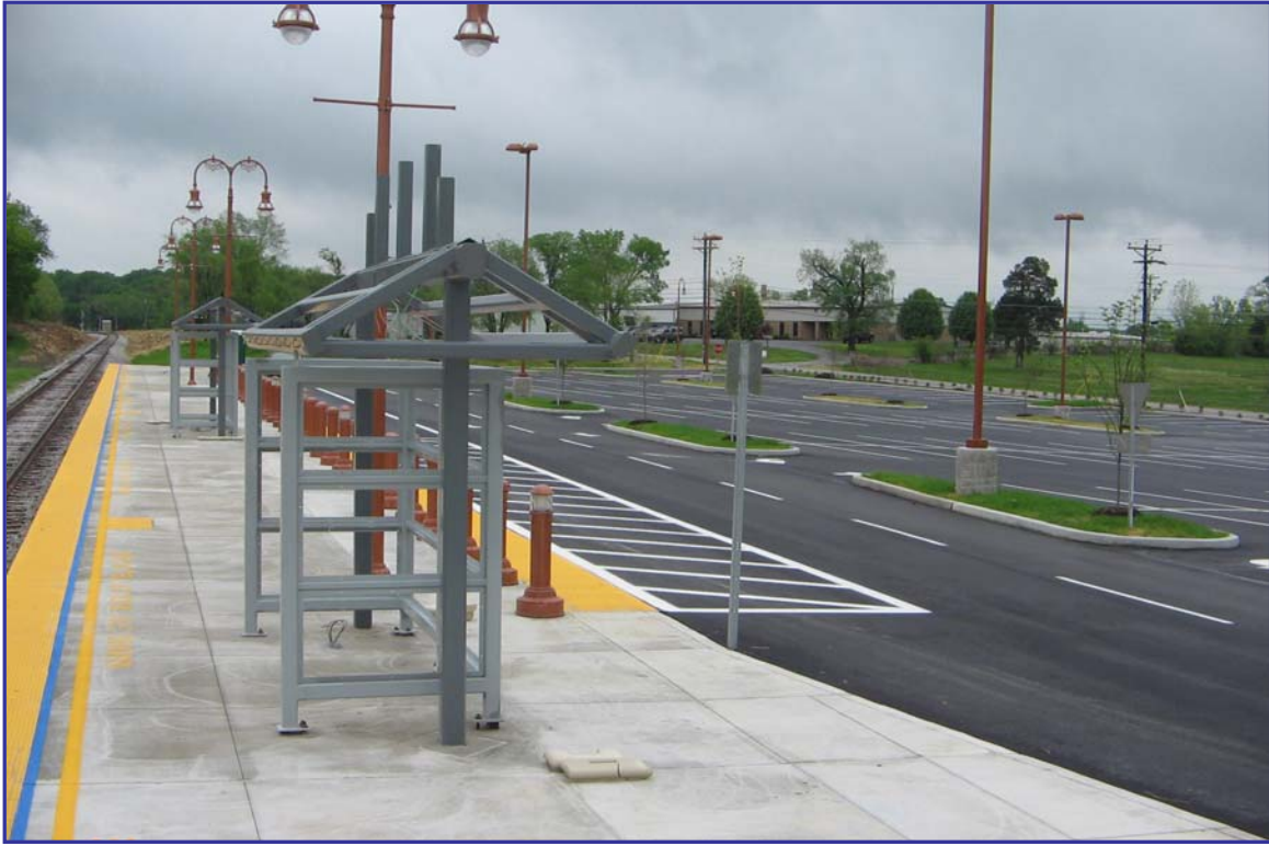
April 21, 2006 – Mt. Juliet Station with Paved Parking Lot