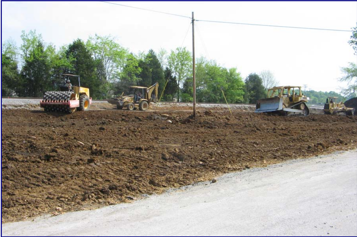
April 18, 2006 – Grading at Martha Station